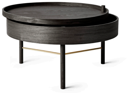
Black Ash/Brass 6900539