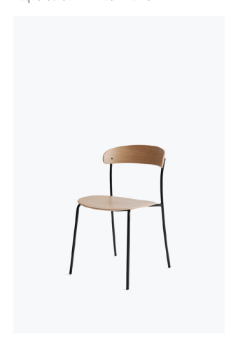
Laquered Oak w. Black Frame