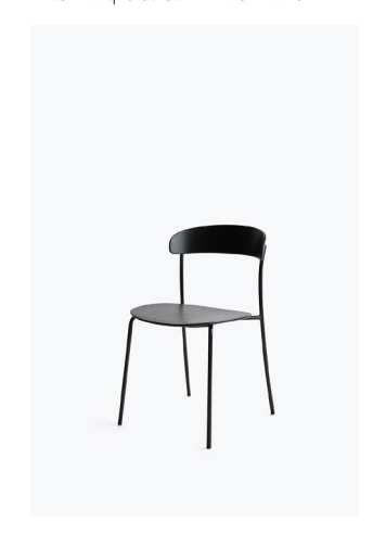
Black Lauquered Oak w. Black Frame