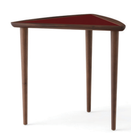
Walnut / Burgundy