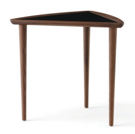
Walnut / Black

Arthur Umanoff believed that design should not only be beautifully constructed and functional, but that it methods to reimagine traditional furniture pieces, he for their quality as for their simplified, functional forms and staying power. Reflecting warmth and practicality, his designs were often imagined in wrought iron, rattan, walnut and birch, imbued with functional details yet retaining a sense of natural elegance thanks to their slender, tapered lines.