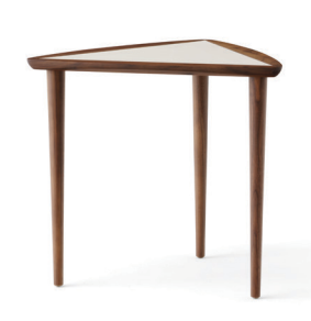
Walnut / Fog