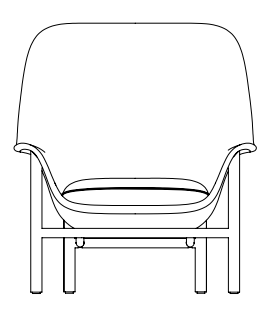
Drape Lounge Chair high wood legs H: 103 x W: 93 x D: 84 x SH: 43 cm