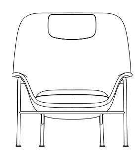
H: 111,5 x L: 77,5 x D: 83 x SH: 43 cm