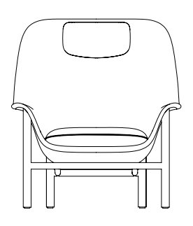
H: 116,5 x L: 82,5 x D: 82,5 x SH: 43 cm