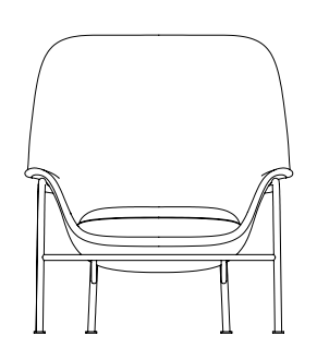
Drape Lounge Chair high steel legs H: 111,5 x L: 77,5 x D: 83 x SH: 43 cm