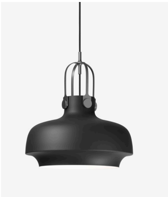
SC7, Matt black