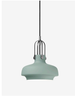
SC6, Matt moss