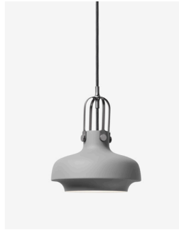
SC6, Matt slate