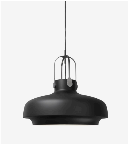
SC8, Matt black