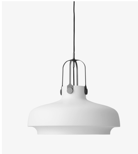
SC8, Matt white