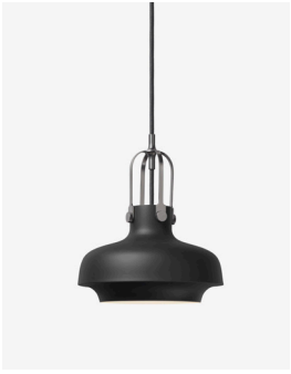
SC6, Matt black