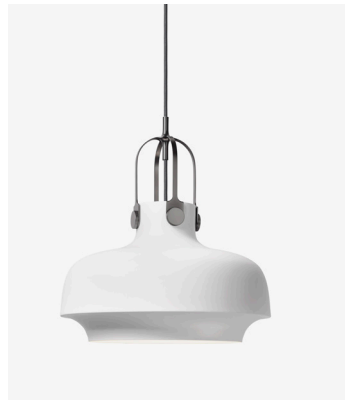
SC7, Matt white