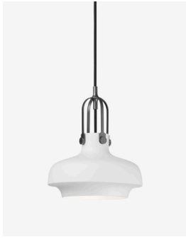
SC6, Matt white