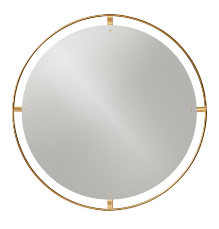
Nimbus Mirror Ø110, Polished Brass 8031839