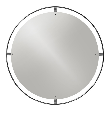
Nimbus Mirror Ø110, Bronzed Brass 8031859