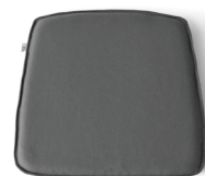
Outdoor, Dark Grey 9585150