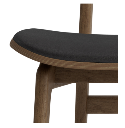
LIGHT SMOKED OAK DUNES ANTHRAZITE 21003