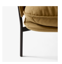
Warm black powder coating